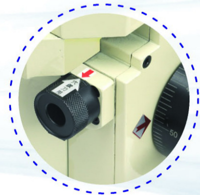
間歇進刀排屑裝置 The device with intermittent feeding & discharge chips.