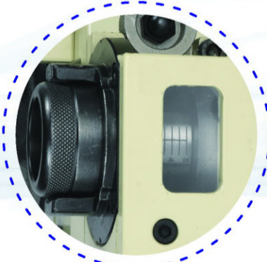
調整切削力裝置 The device with drilling force adjustment