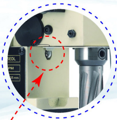
自動停止運轉裝置 Auto stop running device