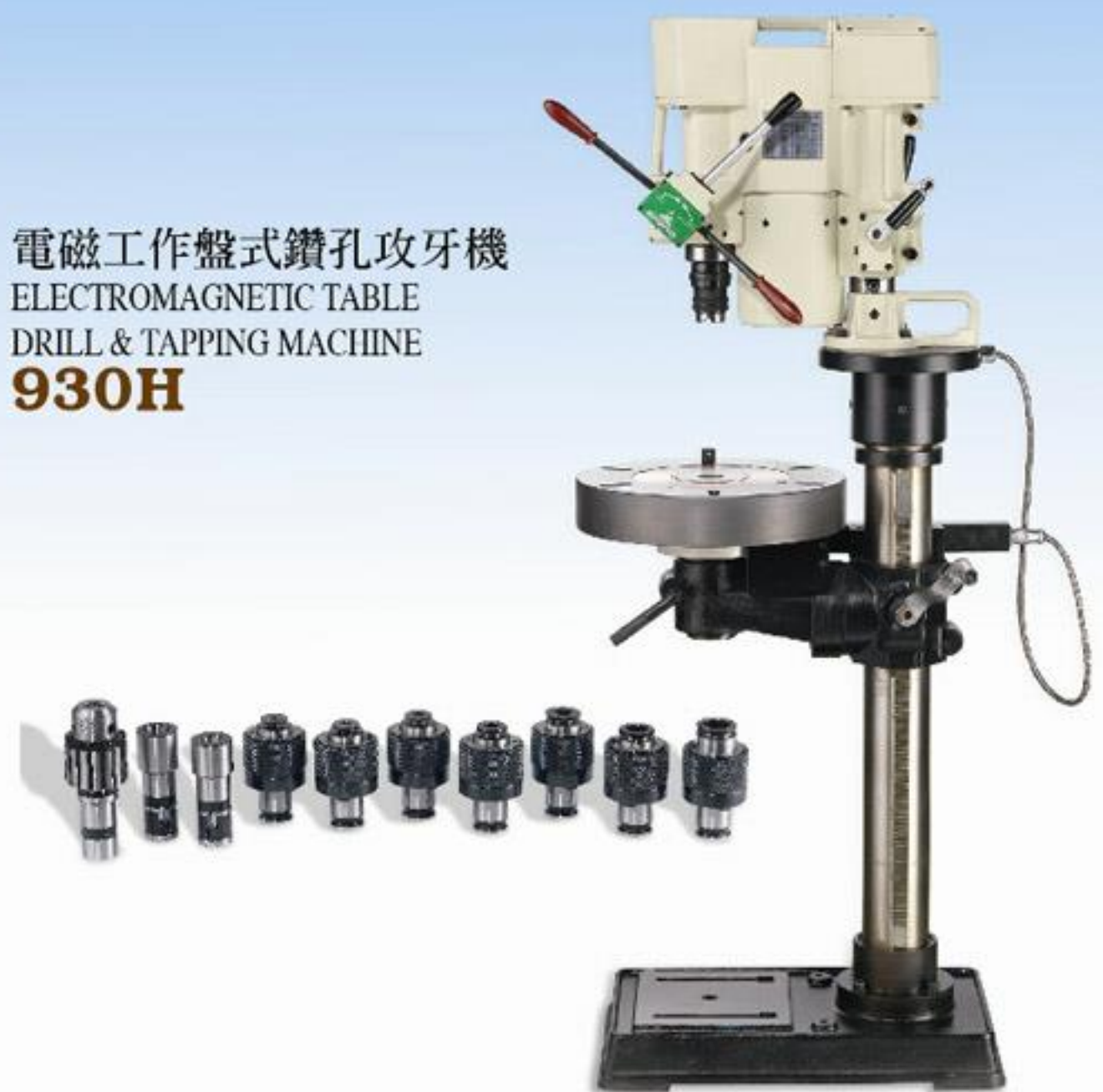
電磁工作盤式鑽孔攻牙機 ELECTROMAGNETIC TABLE DRILL & TAPPING MACHINE 930H