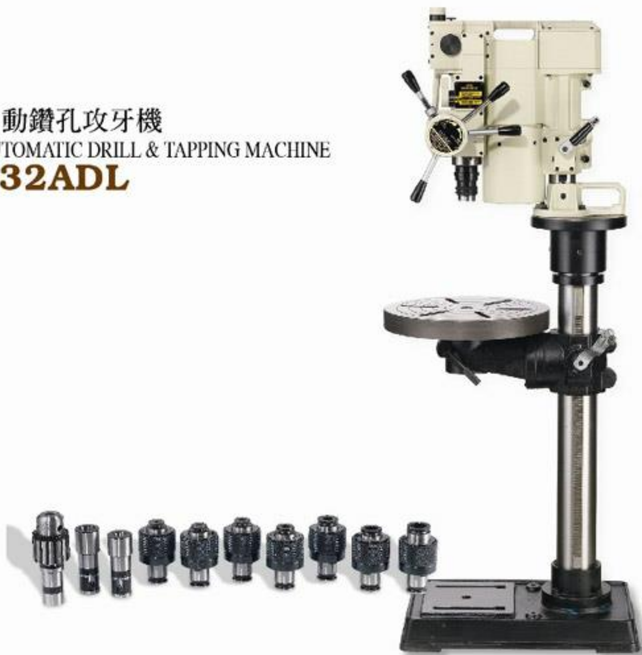
自動鑽孔攻牙機 AUTOMATIC DRILL & TAPPING MACHINE 932ADL