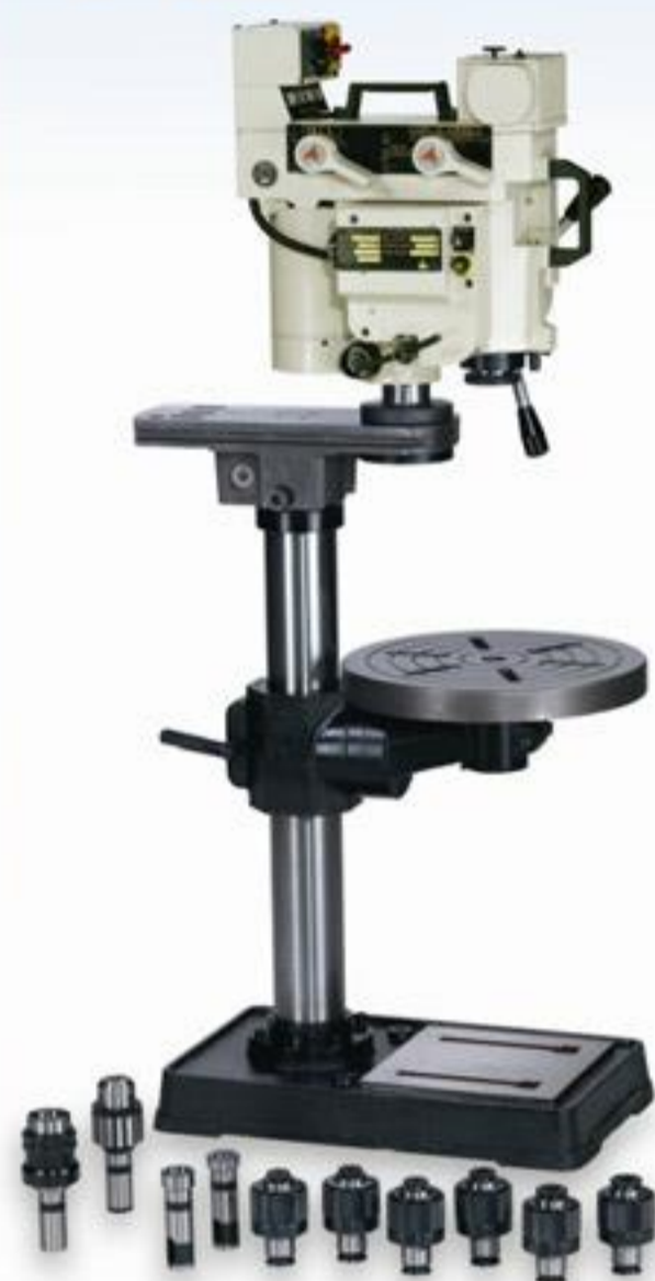
自動鑽孔攻牙機 AUTOMATIC DRILLING & TAPPING MACHINE C-300