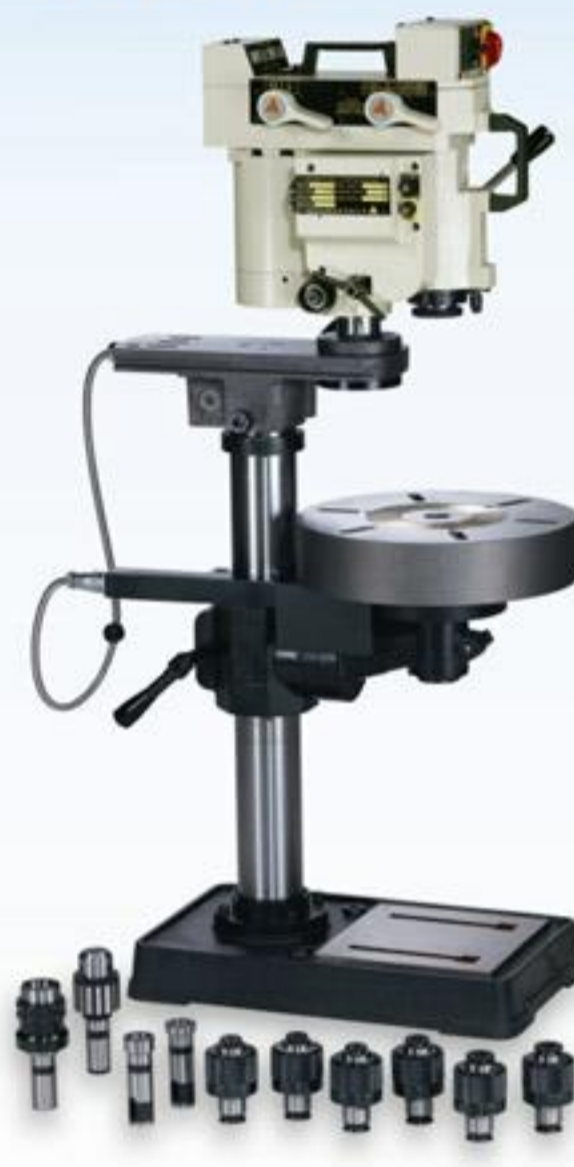
電磁工作盤式鑽孔攻牙機 ELECTROMAGNETIC TABLE DRILLING & TAPPING MACHINE C-250H