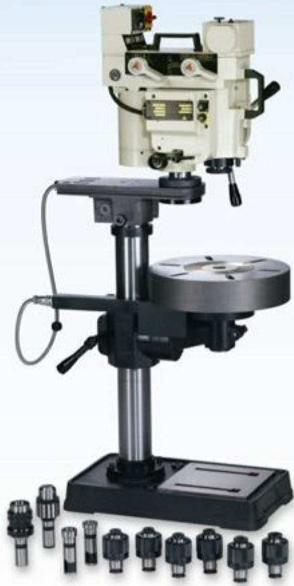
電磁工作盤式自動鑽孔攻牙機 ELECTROMAGNETIC TABLE AUTOMATIC DRILLING & TAPPING MACHINE C-300H