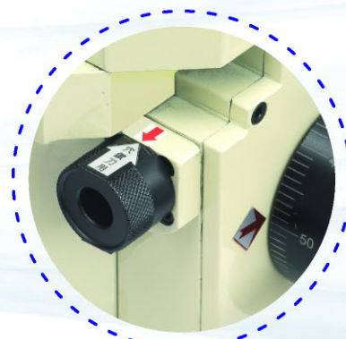
間歇進刀排屑裝置 The device with intermittent feeding & discharge chips.