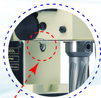
自動停止運轉裝置 Auto stop running device